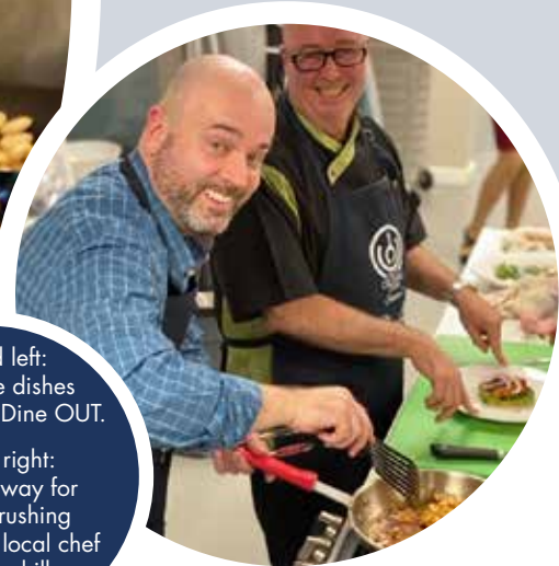
Pictured left: One of the dishes prepared for Dine OUT.